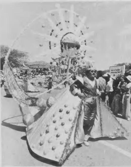
Outer Space Jupiter